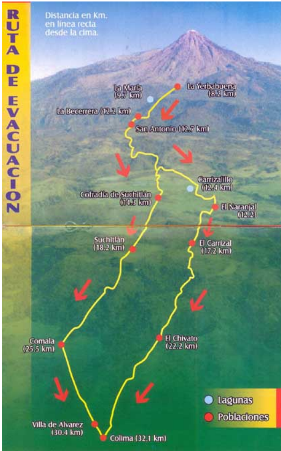
Fig. 3: Colima volcano emergency plan - evacuation route

The figure n. 3 on the left, shows the evacuation route for the villages located south of Colima volcano, designed by the Colima State Civil Protection System.