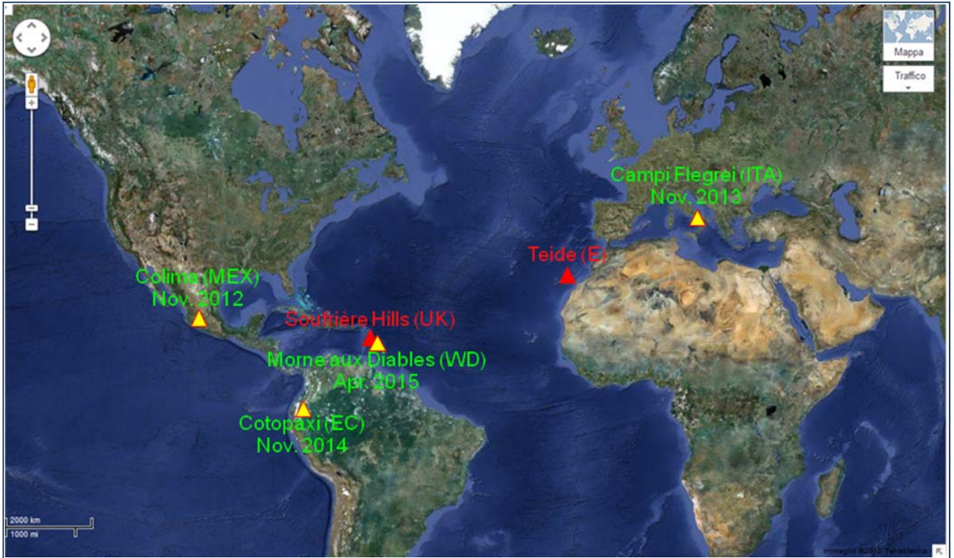
Fig. 1: VUELCO target volcanoes – in green the volcanoes where an exercise is planned to take place, in red the other volcanoes included in the project

The simulations will also take into account real monitoring capacities at specific volcanoes, so to evaluate the kind of information available, the effective capability to detect signals and feed models on the appropriate time-scale at the required accuracy, and the specific needs for monitoring capacity improvements.